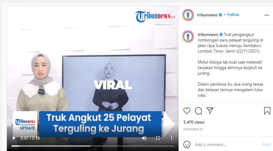
Figure 2. News Used for Learning (Source: Instagram Tribunnews)

www.instagram.com/tv/CWmp8Kijwqo/?utm_medium=share_sheet