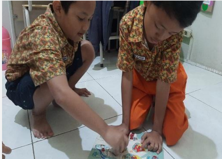
Figure 1. Interaction With Friend